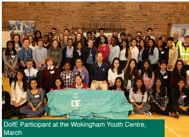
DofE Participant at the Wokingham Youth Centre, March