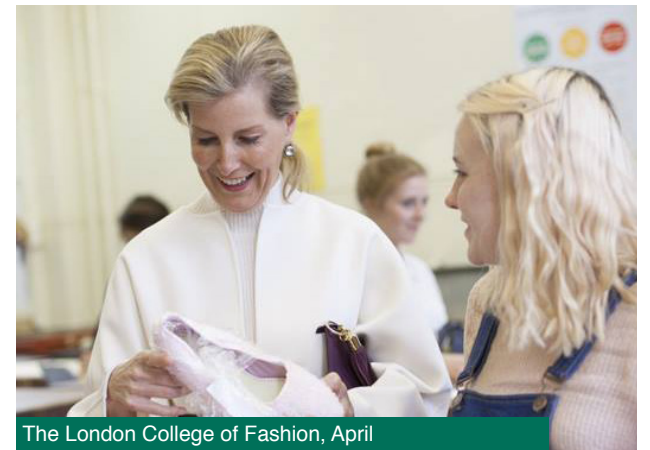
The London College of Fashion, April