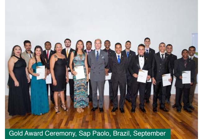
Gold Award Ceremony, Sap Paolo, Brazil, September