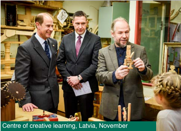
Centre of creative learning, Latvia, November