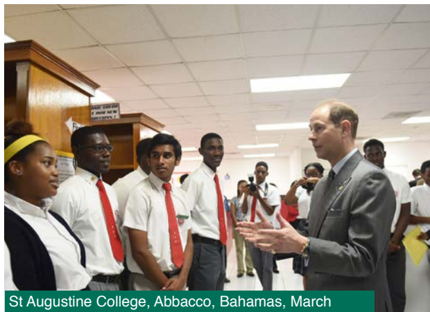
St Augustine College, Abbacco, Bahamas, March