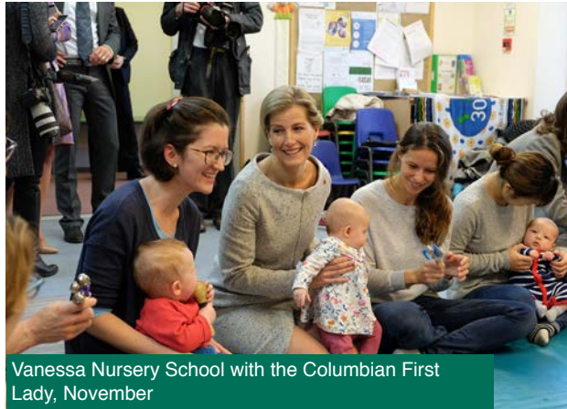
Vanessa Nursery School with the Columbian First Lady, November