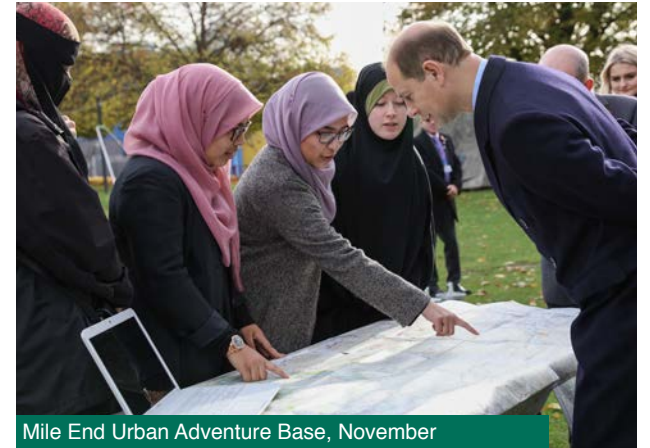
Mile End Urban Adventure Base, November