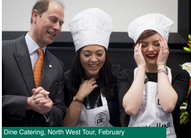
Dine Catering, North West Tour, February