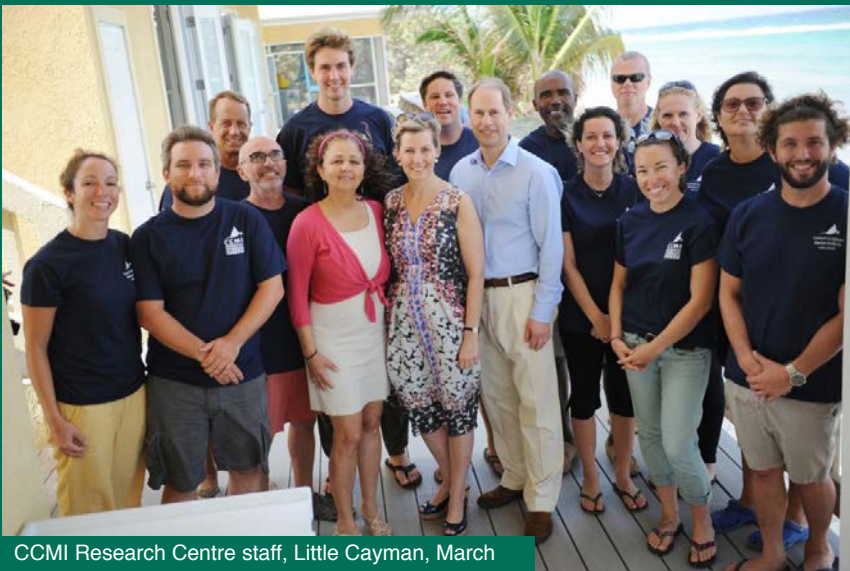
CCMI Research Centre staff, Little Cayman, March

In September, as Patron of the British Paralympic Association, The Earl attended several days of competition at the Rio de Janeiro Paralympics and witnessed some of the extraordinary successes of our British athletes. As part of the same visit, His Royal Highness toured Uruguay and Chile on behalf of both the International Award and the Foreign and Commonwealth Office. One of the highlights was a visit to the British & Commonwealth Fire Company Foundation in Santiago, of which The Earl is an Honorary Member. His Royal Highness saw for the first time - and was most impressed by the Company's 'new' fire station, the foundation stone of which The Earl had laid on his last visit, nine years previously.