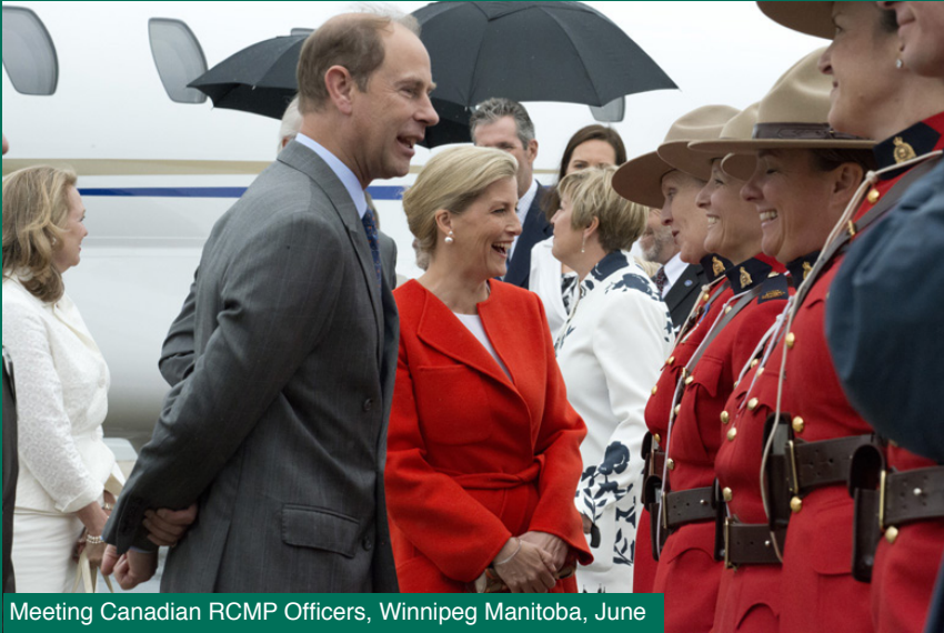
Meeting Canadian RCMP Officers, Winnipeg Manitoba, June

Their Royal Highnesses were also welcomed to Canada in June for a five-day tour and undertook engagements in Ontario, Manitoba, Saskatchewan and Alberta. The Countess visited the wildfire-damaged community of Fort McMurray before Their Royal Highnesses attended another anniversary event, a 50th anniversary gala & performance for the Globe Theatre in Regina of which The Earl is Patron.