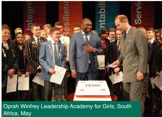
Oprah Winfrey Leadership Academy for Girls, South Africa, May