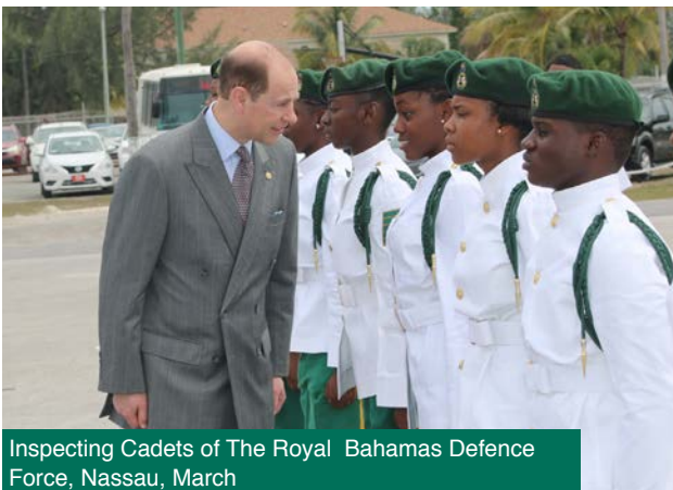
Inspecting Cadets of The Royal Bahamas Defence Force, Nassau, March