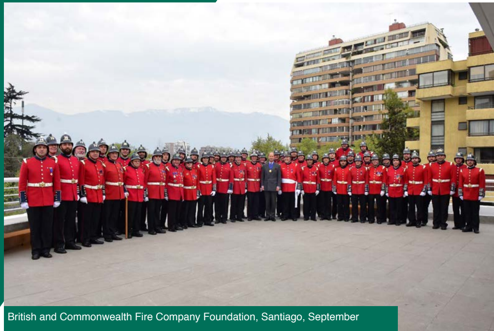
British and Commonwealth Fire Company Foundation, Santiago, September