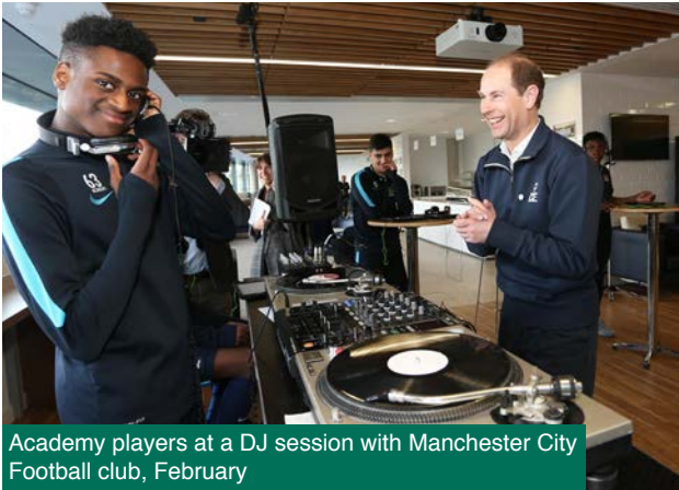
Academy players at a DJ session with Manchester City Football club, February