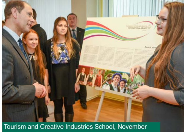
Tourism and Creative Industries School, November