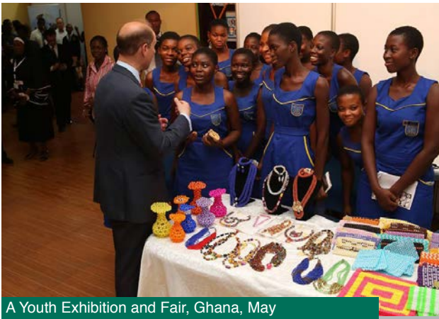
A Youth Exhibition and Fair, Ghana, May