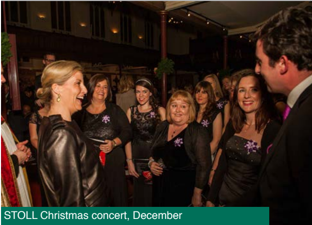
STOLL Christmas concert, December