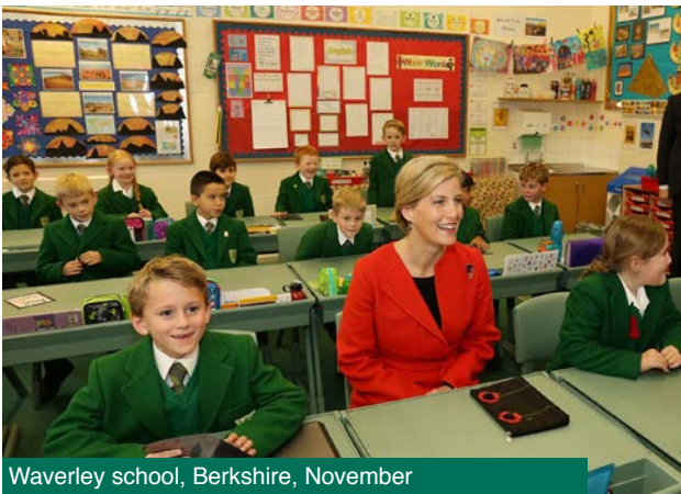
Waverley school, Berkshire, November