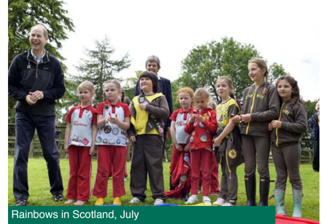
Rainbows in Scotland, July