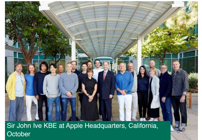
Sir John Ive KBE at Apple Headquarters, California, October