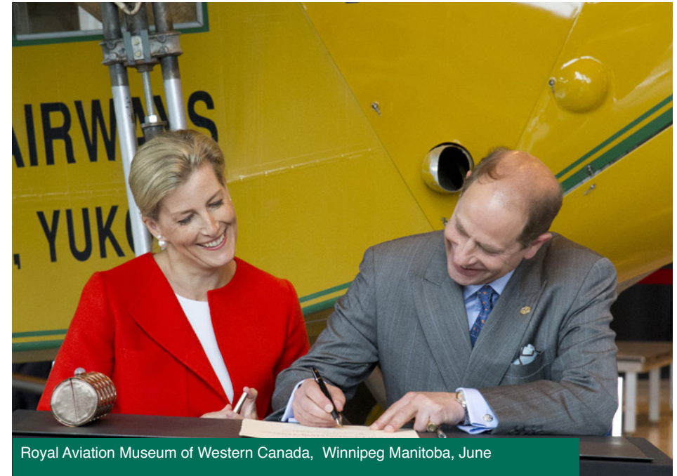
Royal Aviation Museum of Western Canada, Winnipeg Manitoba, June

The Earl and Countess travel extensively each year as ambassadors for Her Majesty The Queen, the British Government and the charities they represent.