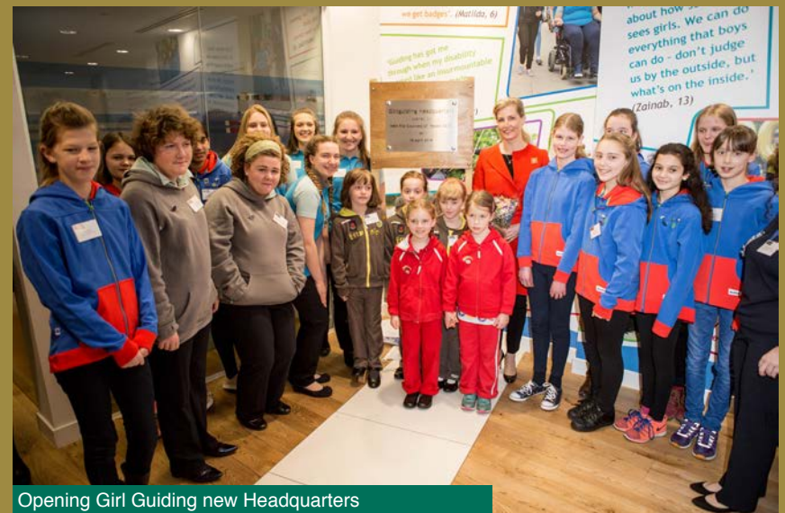
Opening Girl Guiding new Headquarters